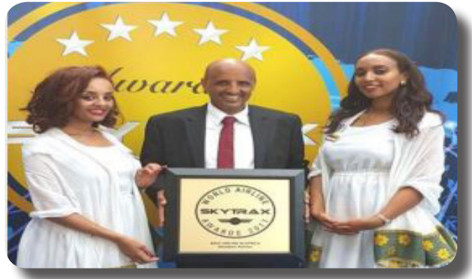
SKYTRAX World Airline Award for The Best Airline in Africa on June 20, 2017 at the Paris Air Show.