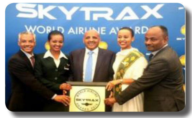
SKYTRAX World Airline Award for The Best Airline staff in Africa for the 2nd time on July 12, 2016.