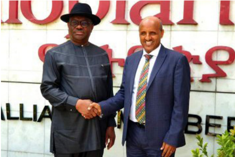
Nigerian Governor Visit Ethiopian Airlines