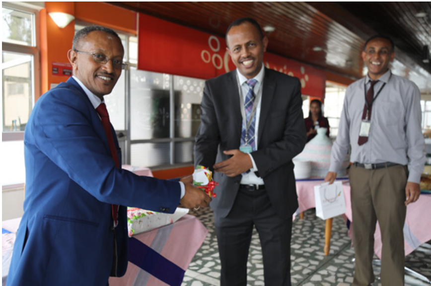
Ethiopian International Services Staff Congratulate Colleague on His Promotion