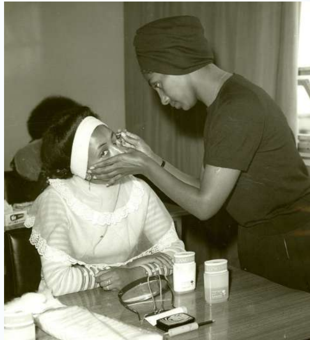
Hands on training for Cabin Crew