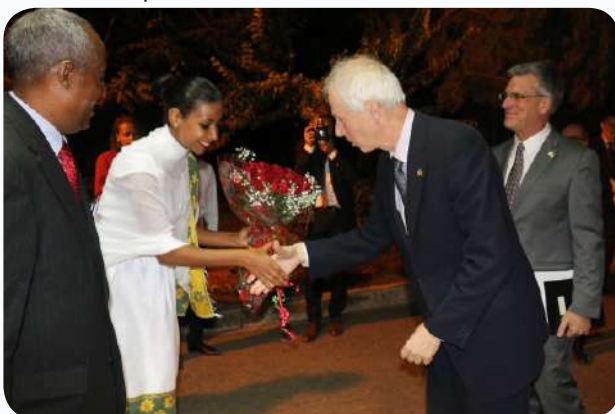
H.E. Mr. Stephane Dion, Canadian Foreign Minister