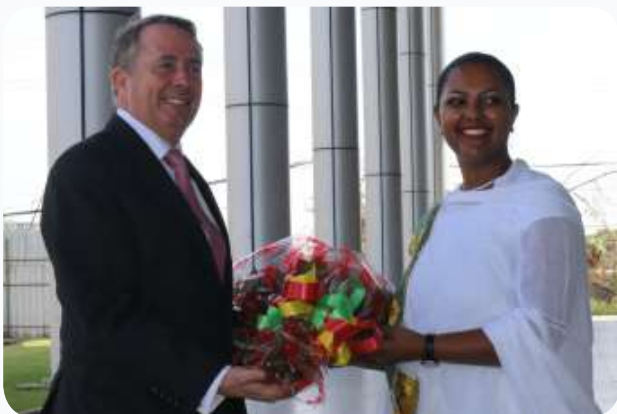
Dr. Liam Fox, British Secretary of State Department for Trade