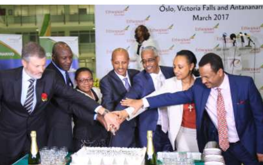
Antananarivo, Victoria Falls & Oslo

Ethiopian launched seven new destinations within five months during the 2017 calendar year. This is one of the greatest expansions in Ethiopian's long and illustrious history. From February to June, Ethiopian launched new services to Victoria Falls (Zimbabwe), Antananarivo (Madagascar), Conakry (Guinea), Oslo (Norway), Chengdu (China), and Singapore (Singapore). With the addition of these stations, Ethiopian has service from Addis Ababa to more than 100 different international cities located across the world. Besides, ET continued domestic network expansion to Shire Endasselassie. This is to enhance the domestic travel experience with a view to facilitate the increased flow of tourism, investment and trade to all the regions of the country.