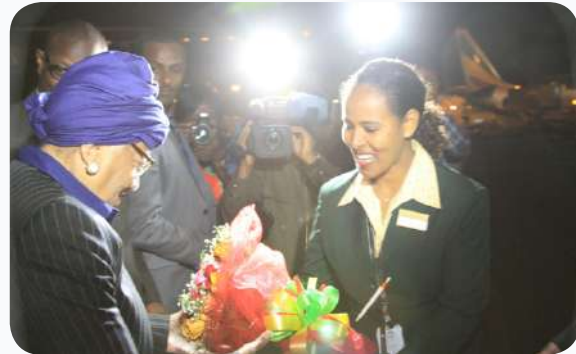
H.E. Mrs. Ellen Johnson Sirleaf, Liberia President