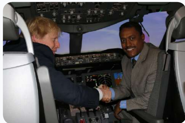
Honorable Mr. Boris Johnson, British Secretary of State for Foreign & Commonwealth Affairs