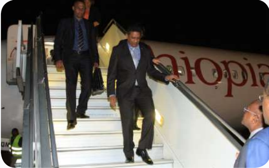
H.E. Mr. Danny Faure, Seychelles President