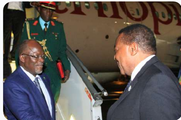
H.E. Mr. John Mogufuli, Tanzania President