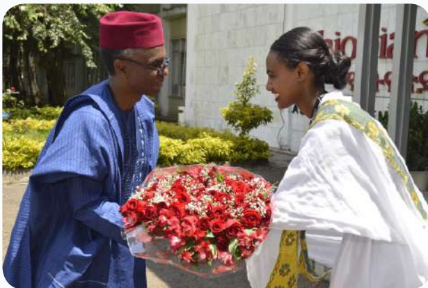
H.E. Mallam Nasir Ahmad El-Rufai, Honorable Governor of Kaduna