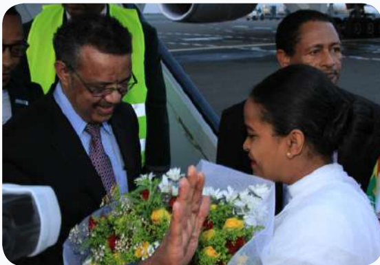
Dr. Tewodros Adhanom, DG WHO