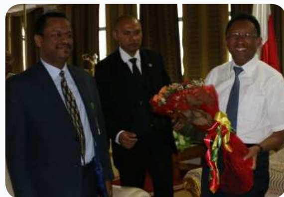
H. E. Mr. Hery Rajaonarimampianina, Madagascar President