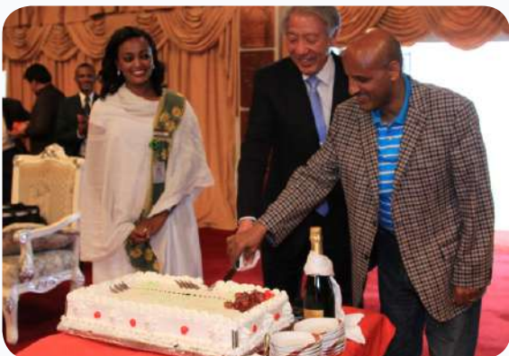
H.E. Mr. Teo Chee Hean, Singapore Deputy Prime Minister