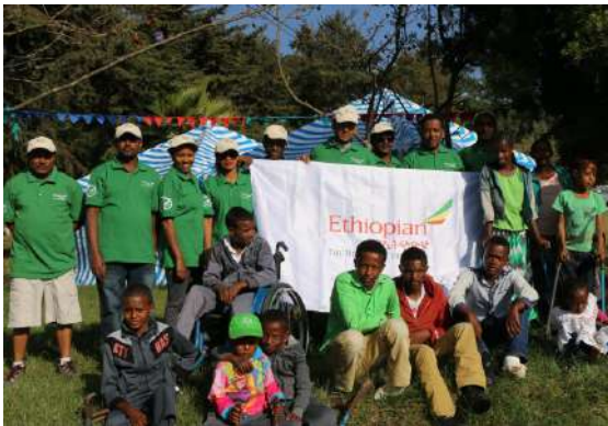
ET Staff with Cheshire's Children

Ethiopian has served the worthy initiative of Cheshire Services Ethiopia for more than a decade through their fundraising walking culture. This walking tradition has allowed Ethiopian to support more than 8000 differently-abled youth and list of children awaiting surgery to enable them to walk.