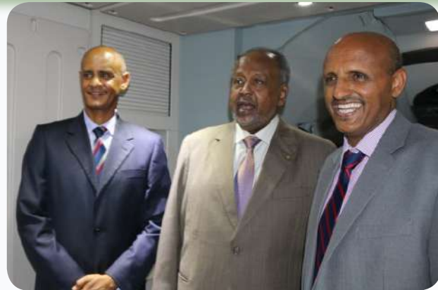
H.E. Mr. Ismail Omar Guelleh, Djibouti President