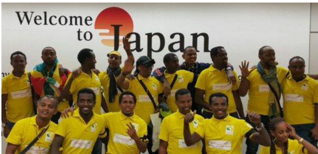
Abebe Bikila Football Team on Ethiopian flight to Japan

The thrice weekly flight, the only direct connection between Africa and Japan, will be operated through Hong Kong with the ultra-modern Boeing 787 Dreamliner aircraft, which offers customers the best on-board comfort with the biggest windows in the sky, high ceiling, less noise than any aircraft with less carbon footprint, and higher cabin humidity ideal for long haul travel.