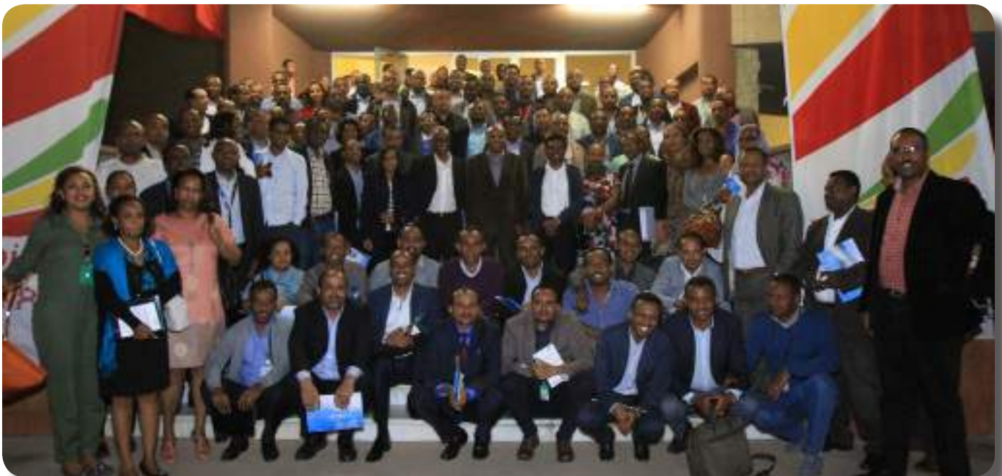
Area Manager's Group Picture