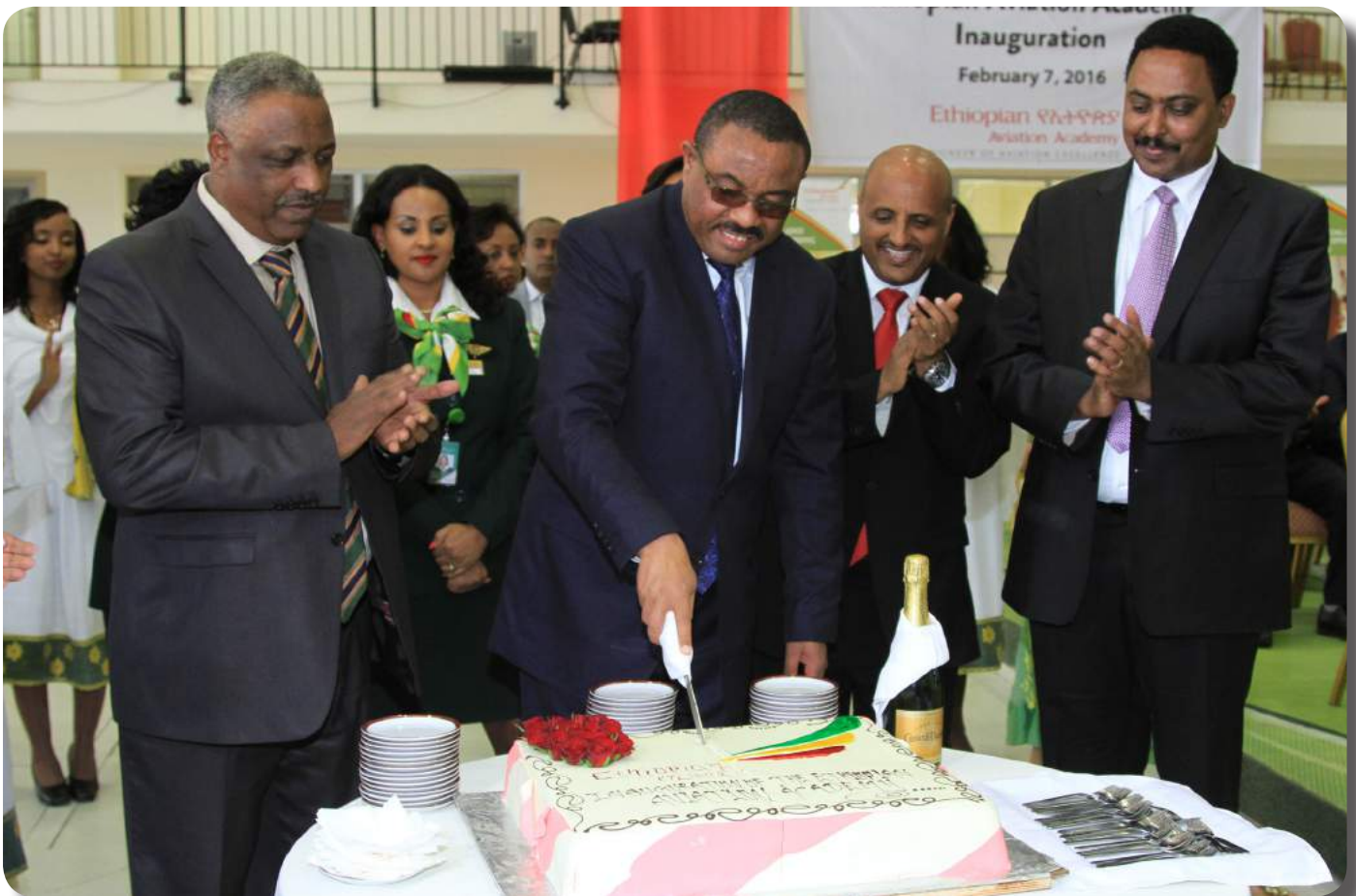
Cake cutting ceremony