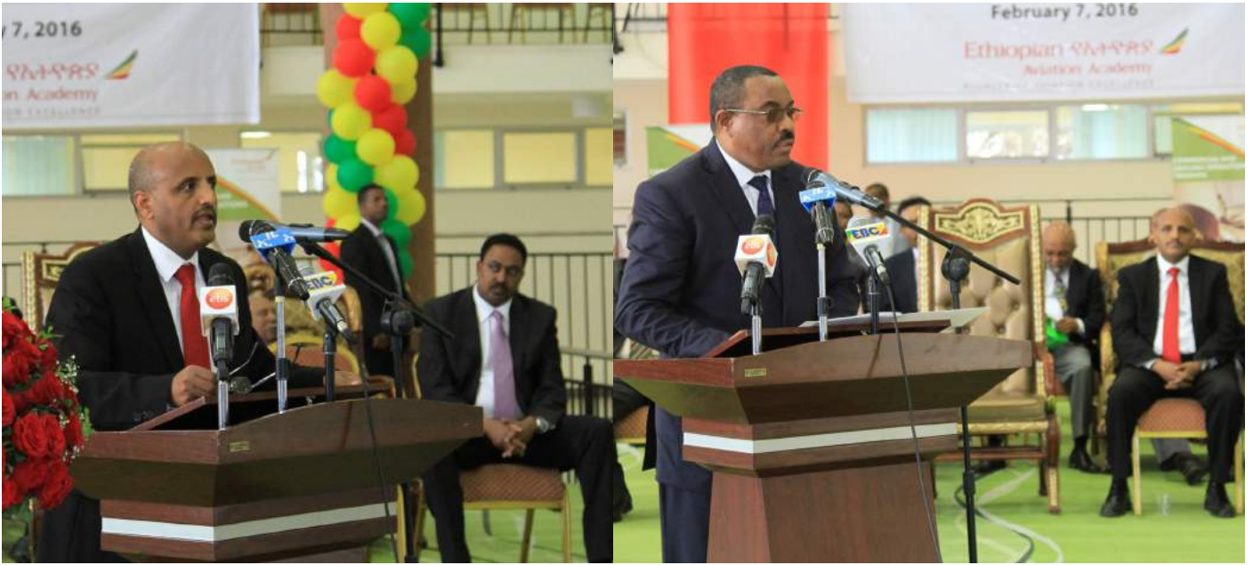
Group CEO & H.E giving a speech at the ceremony