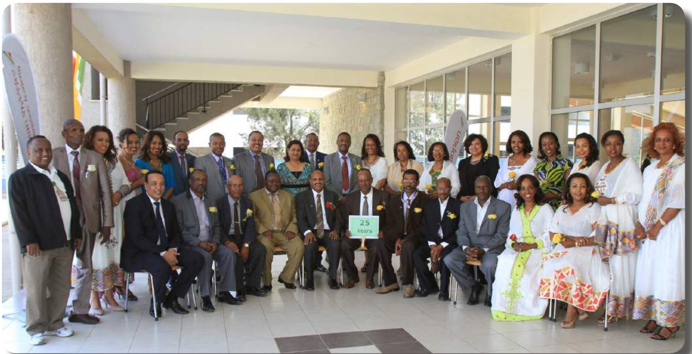
Group picture of awardees

Ethiopian marked Employees' Annual Service Anniversary and Retirees Day at an event held on February 13, 2016 at the newly built Aviation Academy Cafeteria. The event was graced by the Chairman of the Board of Directors, H.E. Ato Abadula Gemedo and other board members, the Executive Management team, Chairman of the Ethiopian Retirees Association, The President of the Ethiopian Airlines Employees Labour Union and other invited guests.