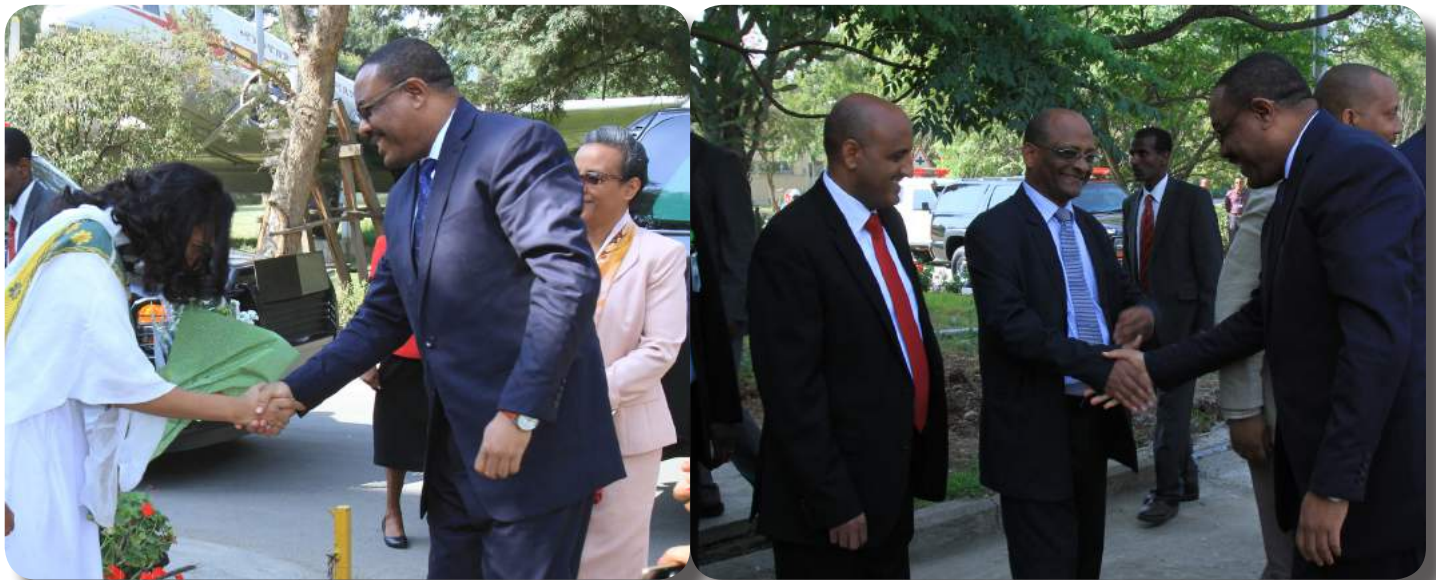
A warm welcome for H.E. Hailemariam Desalegn, Prime Minister of Ethiopia