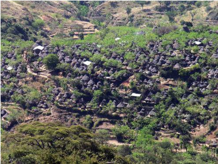
Konso Cultural Landscape

Konso Cultural Landscape is a 55km 2 and property of stone walled terraces and fortified settlements in the Konso highlands of Ethiopia. It constitutes a spectacular example of a living cultural stretching back 21 generations (more than 400 years) adapted to its dry hostile environment. The landscape demonstrates the shared values, social cohesion and engineering knowledge of its communities. The site also features anthropomorphic wooden statues – grouped to represent respected members of their communities and particularly heroic events – which are an exceptional living testimony to funerary traditions that are on the verge of disappearing. Stone steles in the towns express a complex system of marking the passing of generations of leaders.