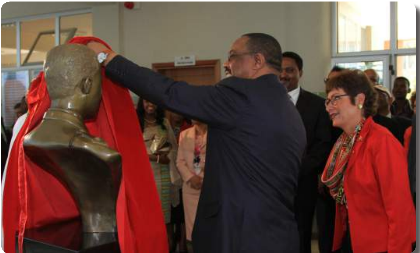
H.E. unveiling Colonel Robinson's sculpture

Though an American, Col. Robinson played a vital role as the commander of the Imperial Ethiopian Air Force during the Italian occupation, and he then contributed to the creation of Ethiopian Airlines by training our first batch of pilots. Col. Robinson will forever remain in the heart of Ethiopians, representing the long-standing spirit of friendship that exists between Ethiopia and the United States.