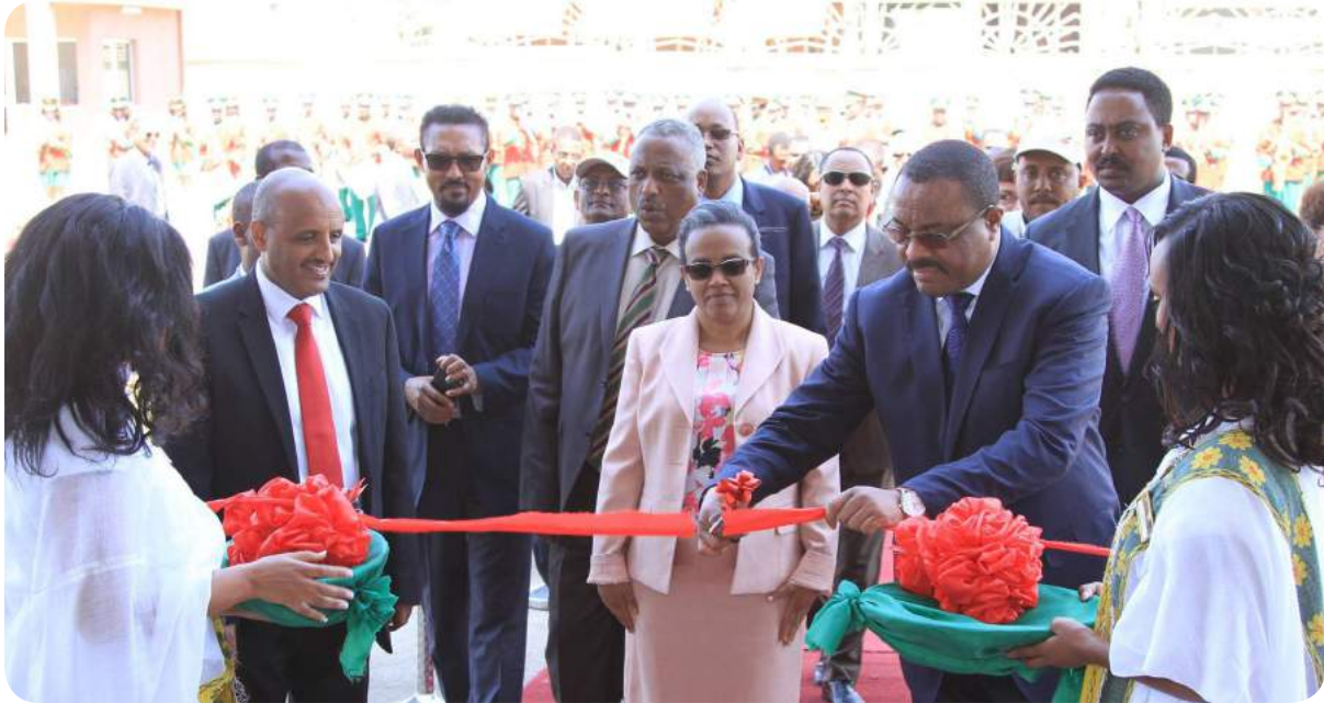
H.E. cutting ribbon to mark the ceremony of the opening of the Aviation Academy

Ethiopian Aviation Academy new facility has been officially inaugurated by H.E. Prime Minister Hailemariam Desalegn.