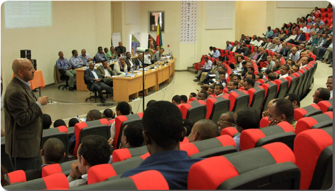
We Always Strive for Service Excellence

Annual Area Managers Meeting held at the Aviation Academy from February 20-21, 2016