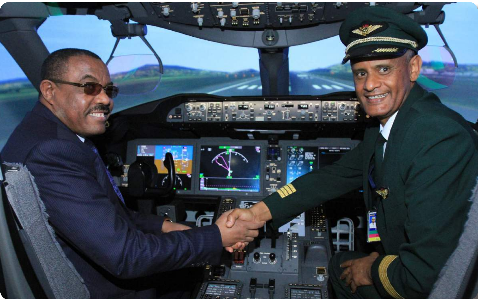
Simulator ride by the Premier