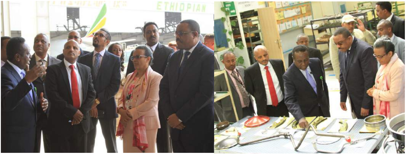
H.E. taking a look at the Hangar Maintenance & student's Work Shop at the Aviation Academy