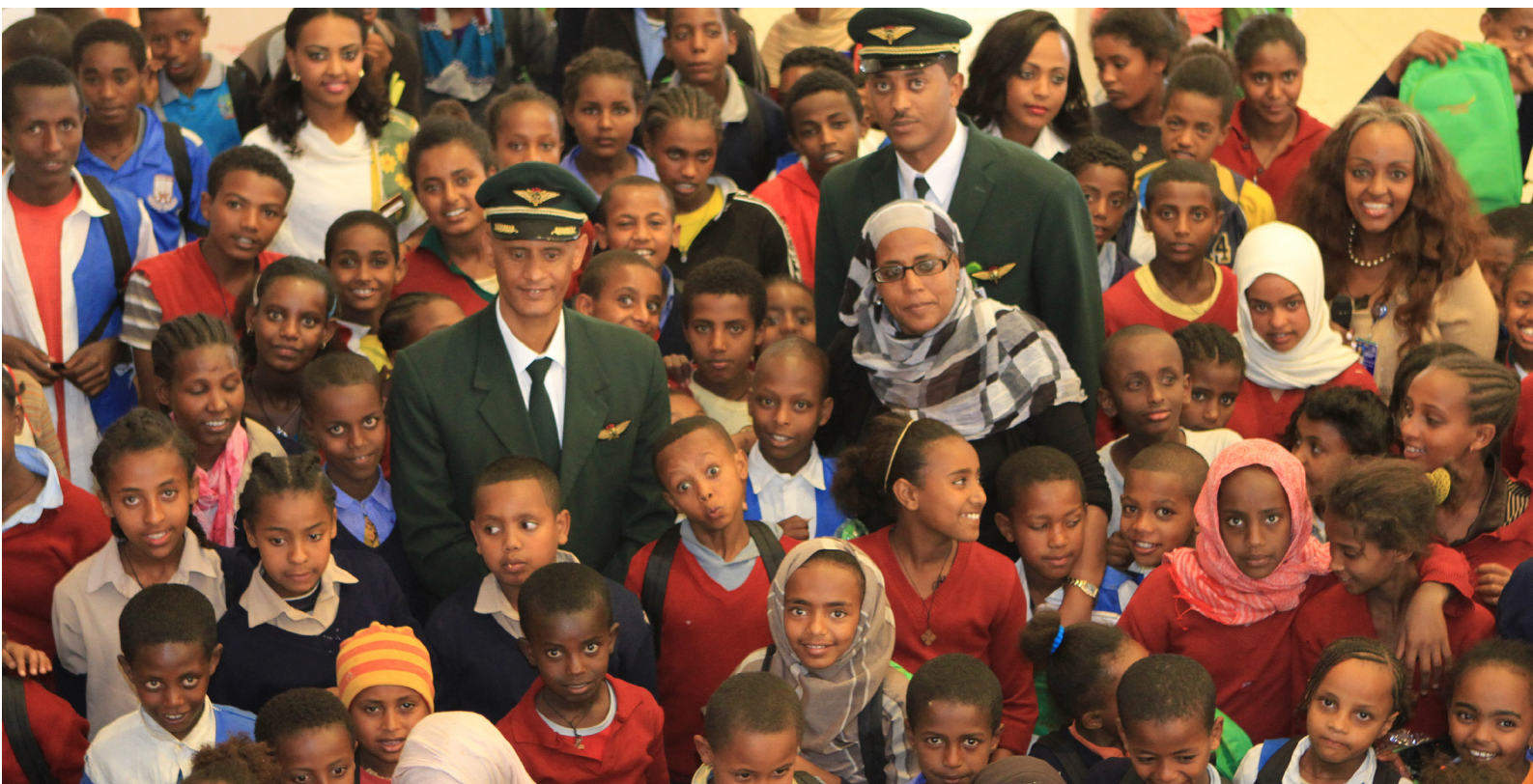
Creating a role model to the children

Ethiopian Airlines launched its lunch feeding program for six elementary and junior secondary schools in Addis Ababa, coming from less fortunate families. The program will be actuated constantly from Monday to Friday.