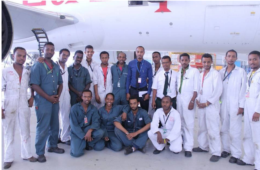
Maintenance team in retrofitting B777

Ethiopian MRO successfully finalized installation of full flat business class seats in all Ethiopian B777 passenger aircraft