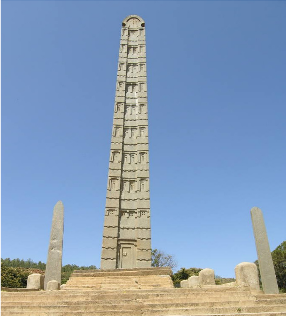
Obelisk of Axum

From the 10 th to the 1 st centuries BC, Axum (also spelled Aksum) was the capital of the great Axumite Empire, which is considered one of the last of the great civilizations. It was a thriving hub of commerce with Red Sea and Indian Ocean ports and the earliest Christian kingdom in the world.