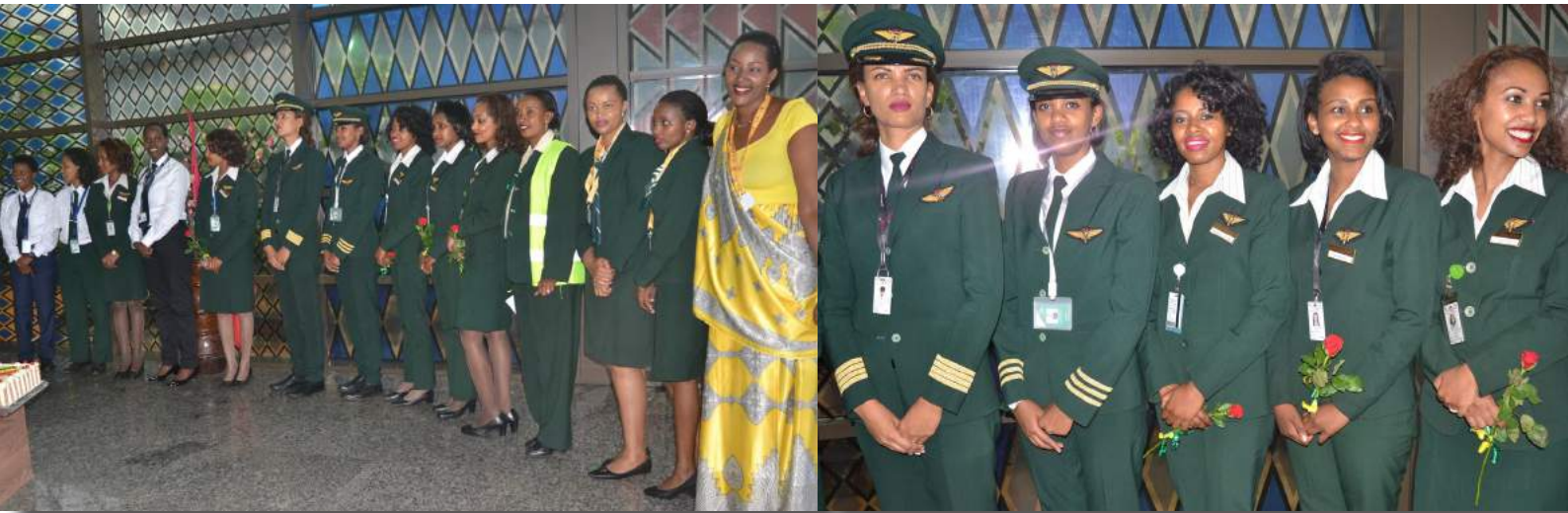
A warm reception for All Women operated flight crew at Kigali