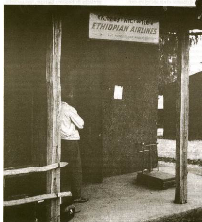
Back in the days, this served as a terminal for Ethiopian Airlines in Mizan Tepi.