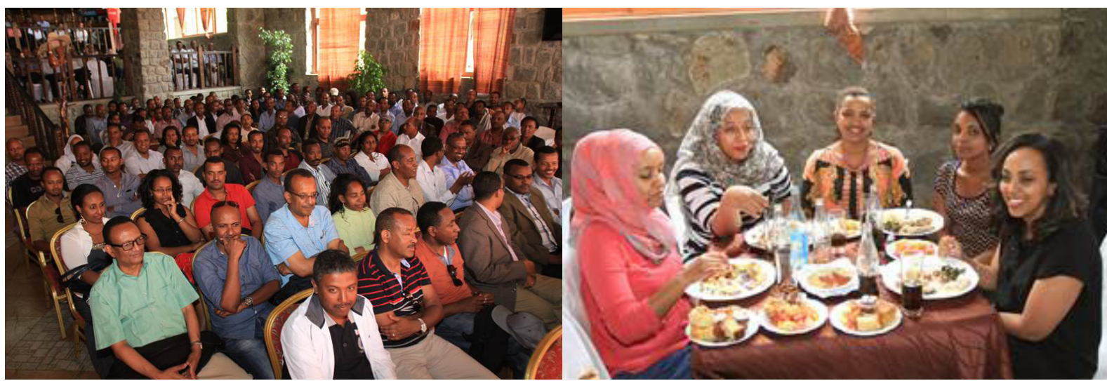
Ethiopian Airlines management members' annual meeting was held at Lisak Resort in Debre Zeit, on October 18, 2015.