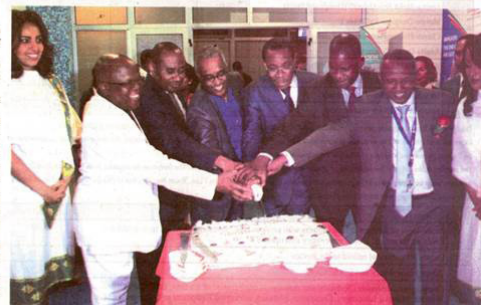
Currently, Ethiopian serves 91 international destinations across five continents with over 232 daily departures. It as well serves 52 destinations in Africa.

አዲስ አበባ ስኔ 12 ቀን 2015 ዓ.ም. ለግልጽ ማሳተፊያ ስራ ላይ ይገኛል።