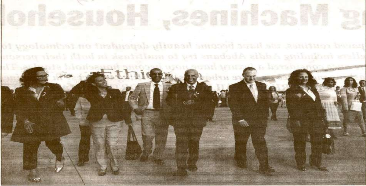
Hirut Zemene (second from left), state minister of Foreign Affairs, Tewolde Gebremariam (centre), CEO of Ethiopian Airlines Group, Michael Raynor (centre-right), the United States ambassador to Ethiopia, and Hirut Woldemariam (PhD) (right), minister of Culture & Tourism proudly saunter after welcoming the brand new Boeing 787-9 Dreamliner. The 787-9 landed at Bole International Airport on October 27, 2017, making Ethiopian the first African Airline to operate such an aircraft.