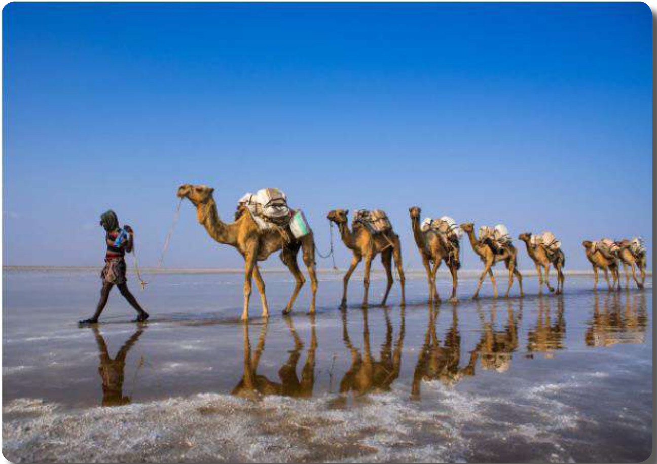
A camel caravan in the Danakil Depression

Ethiopia is not one country, but several countries all in one. Every time I go back there, I discover new things, as I've done ever since my first trip as a child in 1974. There's incredible diversity. You've got the rock churches in Lalibela with pilgrims dressed in white, just like in biblical scenes. And there are tribes from the Omo Valley, in the deep south at the border of South Sudan and Kenya, who are celebrating impressive ceremonies, dressed in cheetah skins and ostrich feathers, or fighting naked with giant sticks for village fame. There are salt lakes welcoming camel caravans in the legendary Danakil, with an active volcano spitting lava at your feet, and ancient Muslim cities, such as Harar, in eastern Ethiopia, where you'll be hypnotised by the chants of the Sufis. For the animal lovers, there's the endemic wolf from Bale Mountains National Park and the gelada baboon in the Simien Mountains.