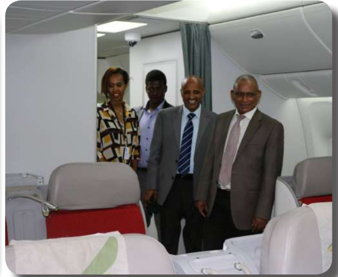
H.E Dr. Debretsion Gebremichael, Minister of Communication and Information Technology visited Ethiopian state-of-the-art facilities; Simulator, Aviation Academy, MRO, Catering and Ethiopian Cargo